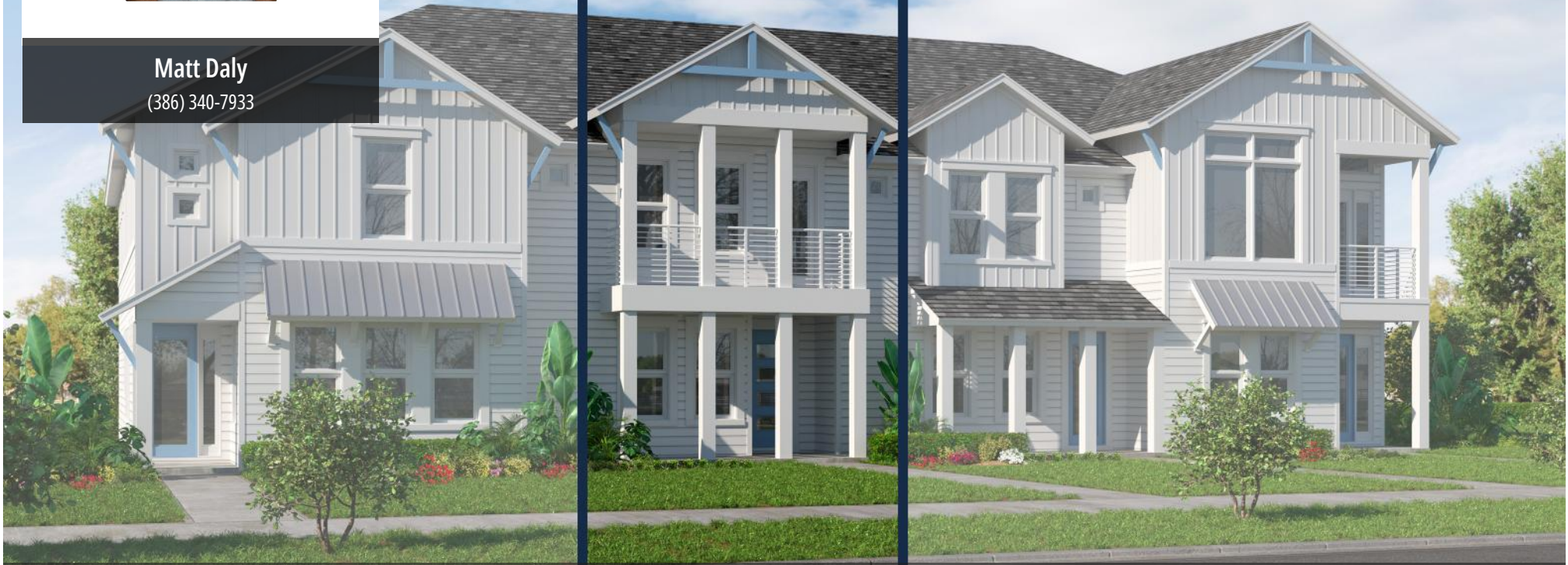
THE CASTILLO - C at NOCATEE