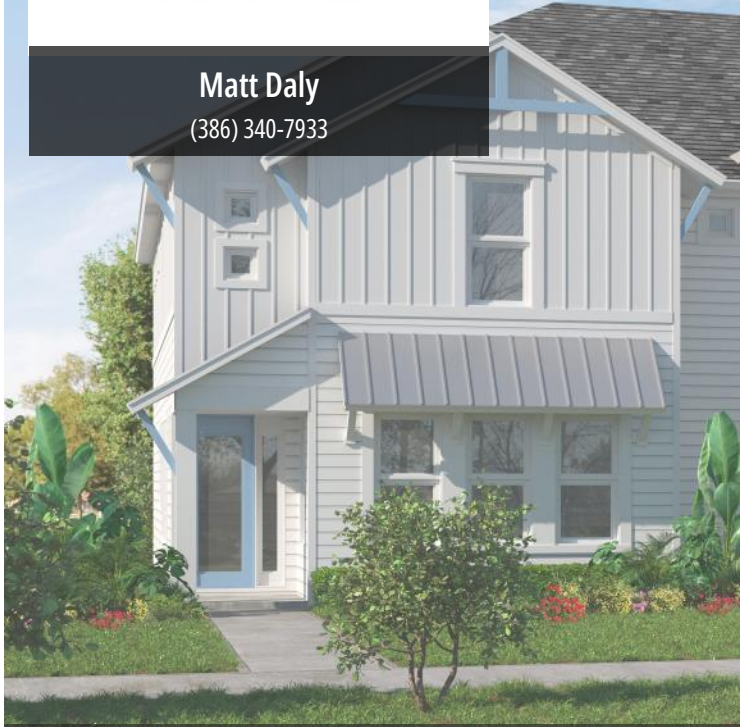
THE CASTILLO - C at NOCATEE