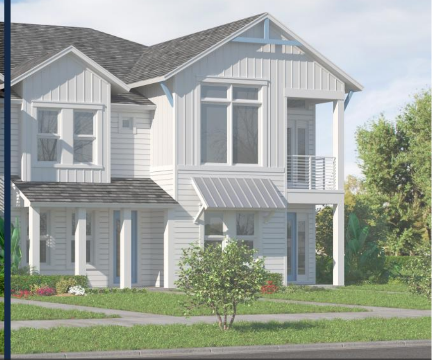
THE CASTILLO - FARMHOUSE