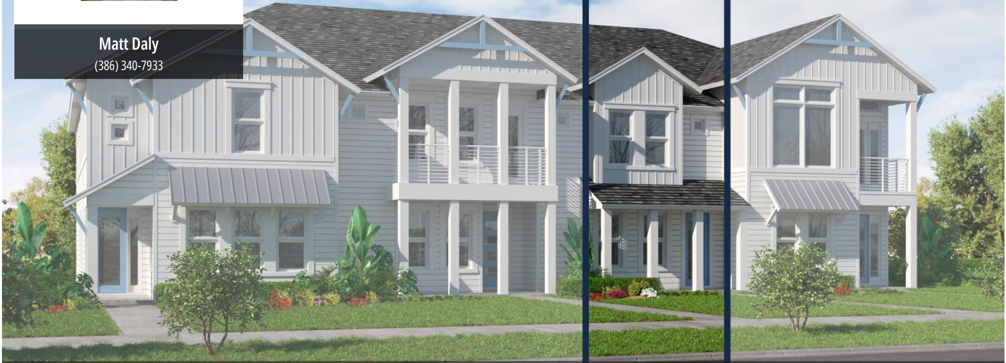
THE DELEON - D at NOCATEE